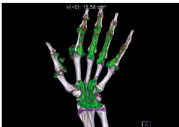
Figure 1. Dual-energy computed tomography image showing involvement of tendons, soft tissue and joints in a patient with tophaceous gout. Three-dimensional volume-rendered image demonstrating monosodium urate crystal deposition in the flexor digitorum I-V tendons and the carpal tunnel.

allowed accurate detection of MSU, which was then colour coded as green and fused onto the standard greyscale CT image. These were reviewed as both cross-sectional and three-dimensional images.