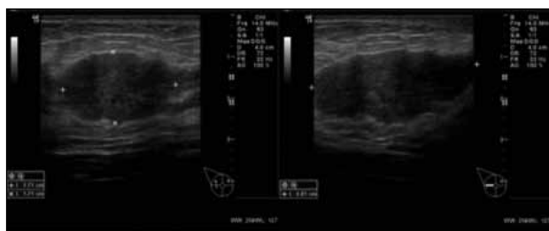
Figure 2. Ultrasound images of the palpable index lesion at the 9 o'clock position of right breast. The lesion measured 2.7 x 1.7 x 4.0 cm. It was hypoechoic with lobulated margin. There was no posterior shadowing or abnormal vascularity. All the other lesions in both breasts showed similar features.

lesion. All of the masses showed similar features (Figure 3a to 3c). They were oval-shaped with lobulated margins. They were T1 isointense, T2 heterogenous with hyperintense components and showed homogenous internal enhancement. The time-intensity enhancement curve revealed a slow initial rise and absence of washout (type I curve) [Figure 3d].