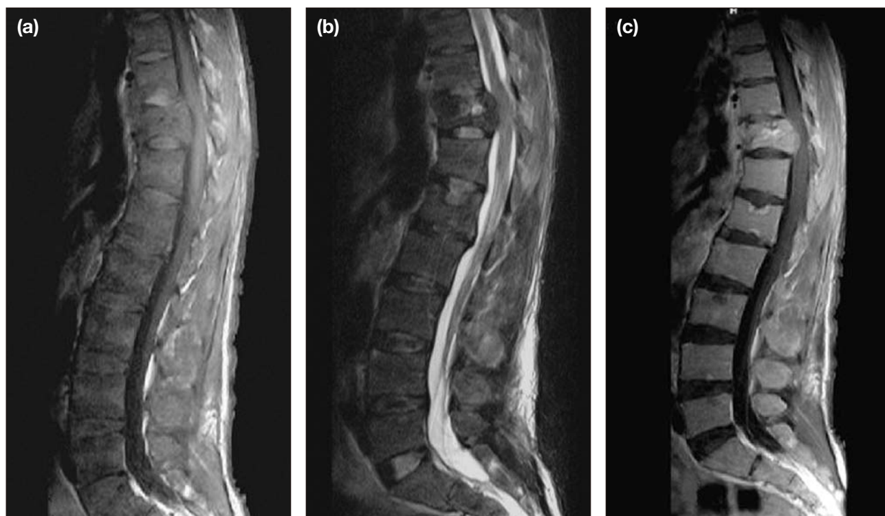
Figure 2. Sagittal (a) T1-weighted and (b) T2-weighted magnetic resonance images demonstrating a low-signal intensity mass invading the T11 vertebra and compressing the spinal cord; and (c) post-gadolinium injection image showing enhancement of the lesion.

Parathyroid hormone (PTH) secretion increases in response to low serum calcium concentrations and enhances the synthesis of 1,25-dihydroxyvitamin D. PTH and 1,25-dihydroxyvitamin D act together to increase