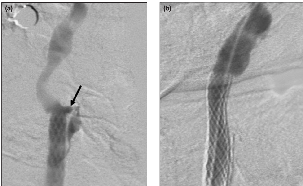
Figure 3. (a) Left carotid artery angiogram performed during the second admission showed a small leaking pseudoaneurysm (arrow) distal to the previously deployed stent graft — excellent flow was seen through the existing stent with occlusion of the pseudoaneurysm; and (b) check angiogram after deployment of a second stent graft shows complete occlusion of the pseudoaneurysm.

vessel with non-haemorrhagic pseudoaneurysm visualised on angiography. The findings suggest an inevitable haemorrhage in the immediate future if no action is taken. Impending carotid blowout occurs as a transcervical or transoral haemorrhage, typically from a pseudoaneurysm bleeding through a surgical wound or fistula that resolves either spontaneously or with pressure. In contrast, acute carotid blowout is a haemorrhage that cannot be stopped only by packing or pressure, as in this patient.