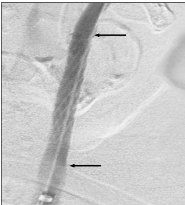
Figure 2. Left common carotid angiogram after deploying the stent (arrows) showed good distal run off and complete obliteration of the pseudoaneurysm.

above the distal part of the previously deployed stent due to a small pseudoaneurysm (Figure 3a). The existing stent graft was in situ and patent. Subsequently, another 10- x 70-mm Wallstent (Boston Scientific, Natick, USA) was successfully deployed through the existing stent. Angiogram post-stenting showed cessation of bleeding and obliteration of the pseudoaneurysm